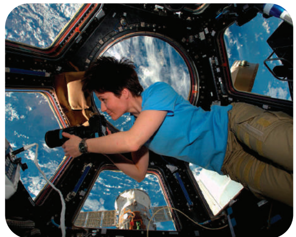
TWO FAMOUS ITALIAN PEOPLE: TIZIANO FERRO (SINGER) E SAMANTHA CRISTOFORETTI (ASTRONAUT)